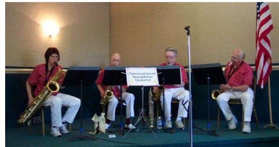
International Saxophone Quartet

Can't Make Our Next Meeting? DO THE RIGHT THING, CALL 489-4638 or 456-4904 For An Excused Absence